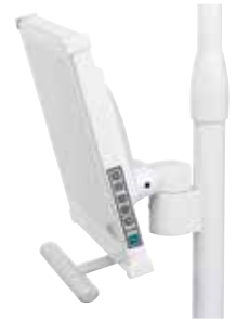
Light monitor mount