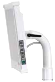
Radius monitor mount