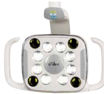
A-dec 500 LED