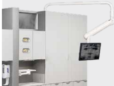
CENTRAL CABINET MOUNT