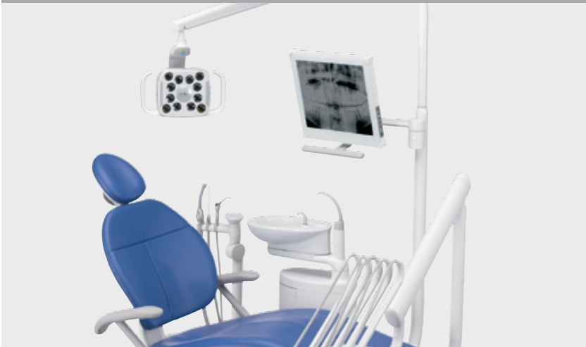
CHAIRSIDE MONITOR MOUNT

A chairside monitor brings the screen closer to the patient, so it's easier to discuss oral health, explain treatment procedures, and gain case acceptance.