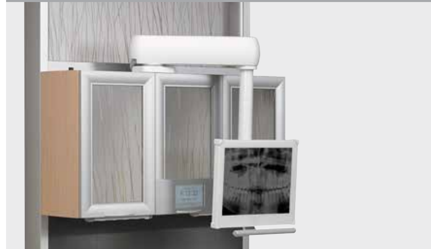
A-DEC INSPIRE® GLIDING MONITOR MOUNT

Integrate a monitor into A-dec Inspire® cabinets. The A-dec gliding monitor mount slides and pivots for picture-perfect positioning between you and your assistant. Mounted at 12 o'clock, it's out of the patient's direct view.