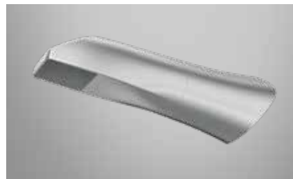
Steel sleeve with sapphire glass window